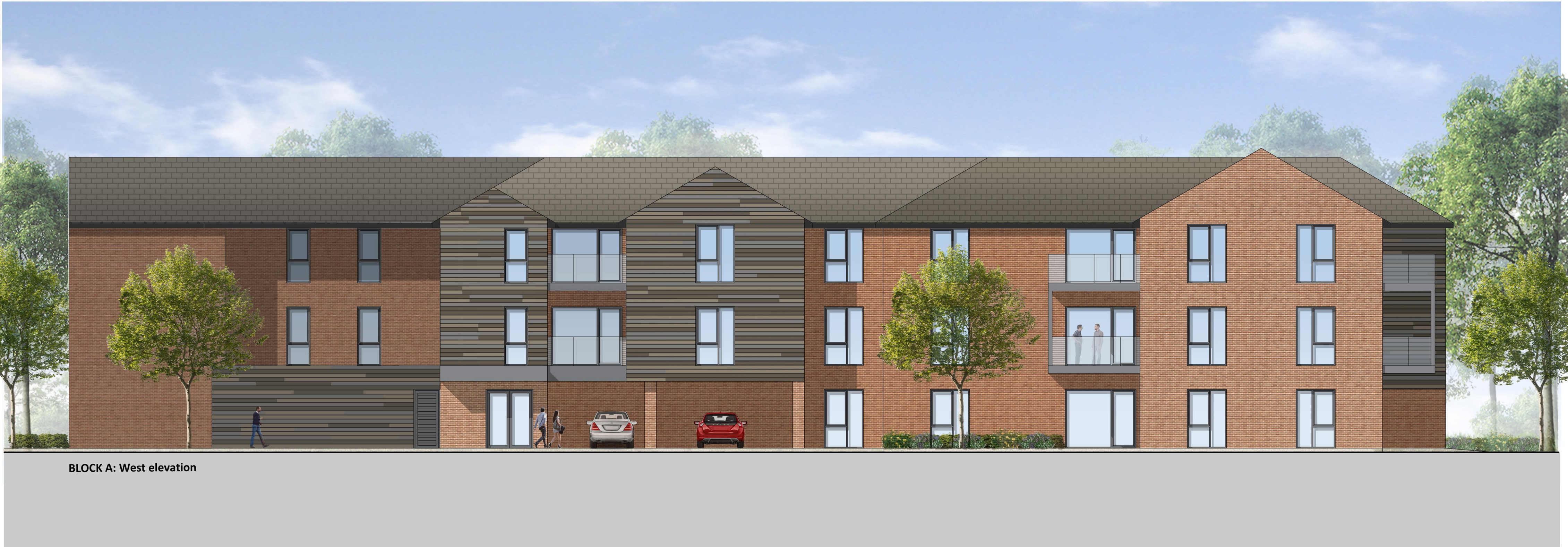
BLOCK A: West elevation