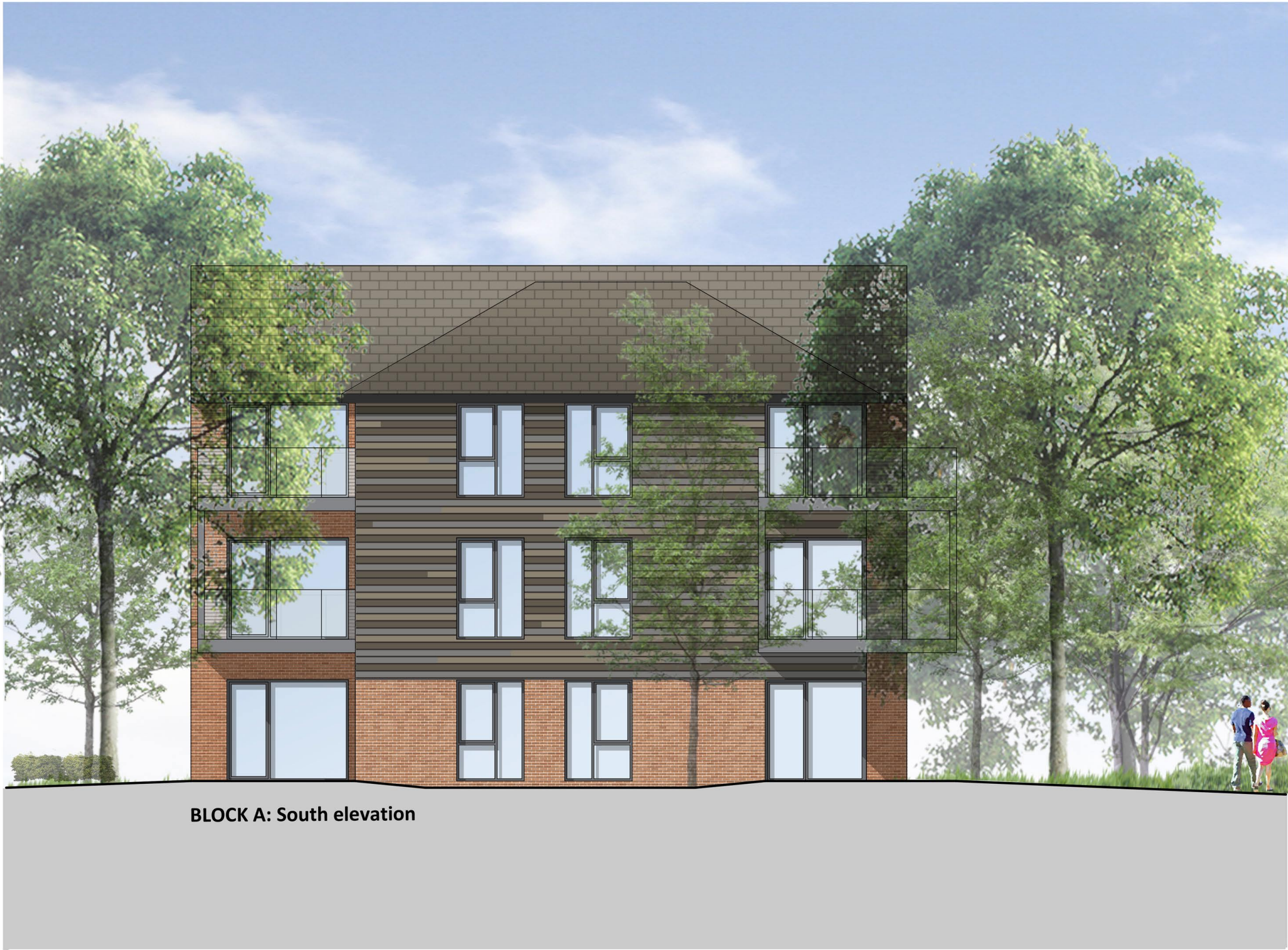
BLOCK A: South elevation