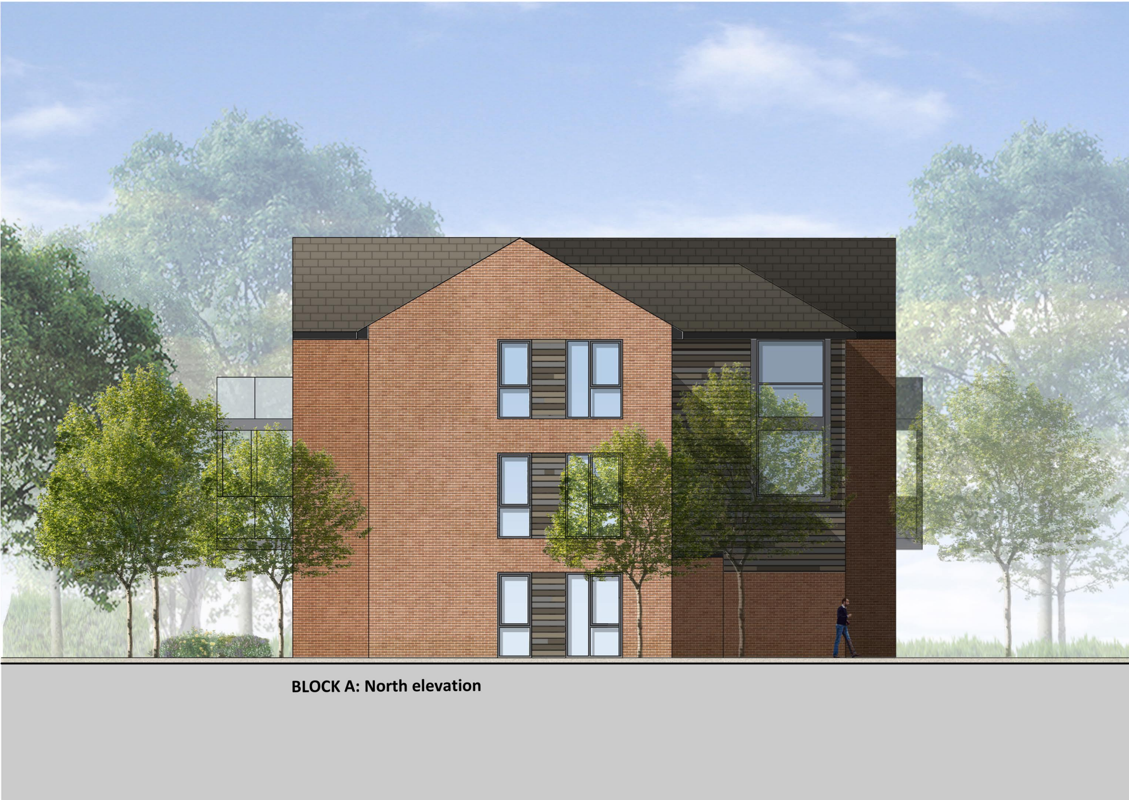
BLOCK A: North elevation